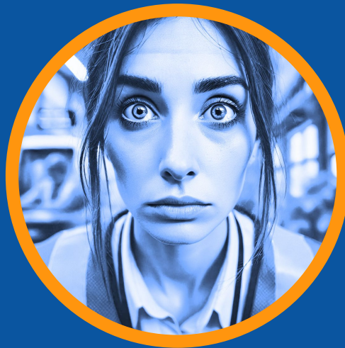
You Are Already Tapped To Capacity