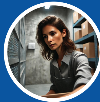
Cellular Dead Zones