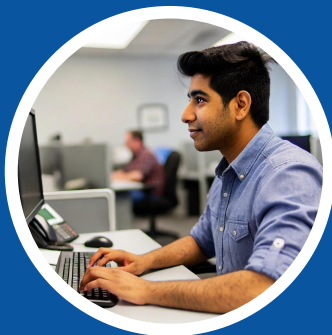
Non-English/ French Speakers