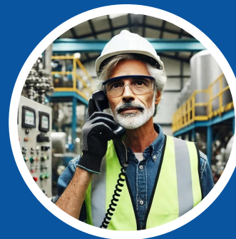
Technology Comfort Levels