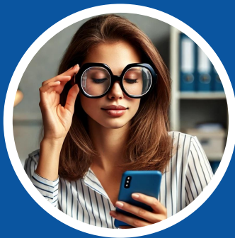
People With Disabilities